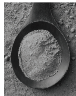
Unprocessed cocoa is a tremendous source of antioxidants.

Oxidation is a natural part of life, and it happens every day in the world around us. Fortunately, our bodies are equipped with some natural defenses against free radicals. (Continued on Page 4)